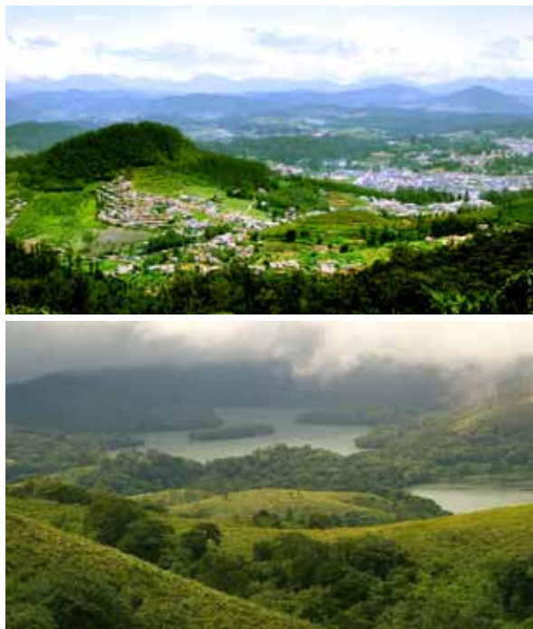
Fig.15.3.1: The Nilgiris - Queen of Hills

The Hill Area Development Programme (HADP) is in operation from the Fifth Five Year Plan (1975 – 1980) in sensitive hill areas of the Country. In Tamil Nadu, the programme commenced in the Nilgiris District with 100 percent financial assistance from the Government of India with a view to supplement the efforts of the State Government in preservation, protection and enrichment of the biodiversity of the Nilgiris District. Later, the funding pattern altered to 90 percent grant from the Government