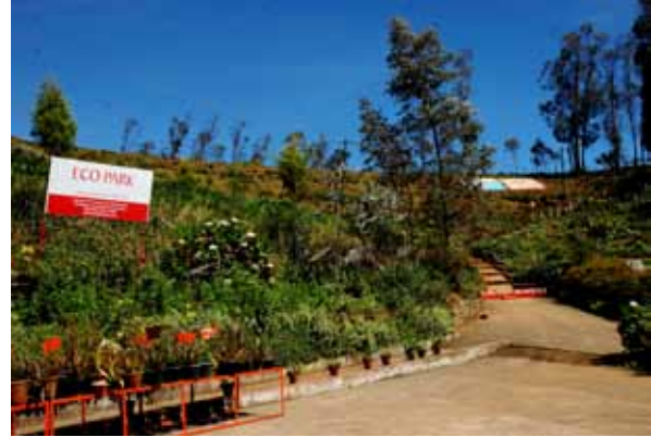
Fig. 15.3.3: Eco park at Ooty

Under forestry sector, afforestation in the degraded and denuded forest and their maintenance, shola afforestation and its maintenance, soil and water conservation activities inside forest areas, forest protection works, special works for wildlife management and eco tourism in forest areas, were undertaken. Under horticulture sector, promotion of coffee, spices, fruit plantations besides restoration of traditional agricultural farming practices, extension of area under economic plantations such as arecanut and coconut, medicinal plant cultivation,