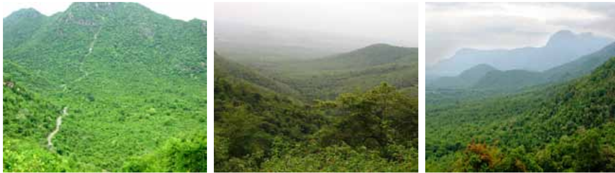
Fig.15.3.11: Eastern Ghats– Tamil Nadu

Eastern Ghats and 4 districts in Southern Eastern Ghats. The major hills in Eastern Ghats are: a) Javadhu hills (Vellore district), b) Pachaimalai (Trichy & Salem districts), c) Kollimalai, Servarayan and Bodamalai (Salem district), d) Kalrayan hills (Salem and Villupuram district), Chitteris and Melagiris (Dharmapuri).