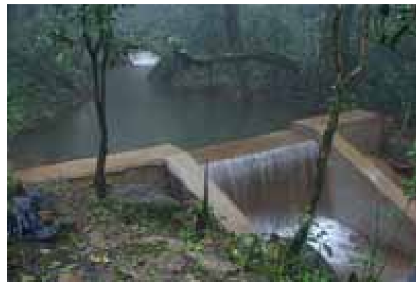
Fig.15.3.8: Water Conservation Works Under HADP

Around 60 percent of the annual outlay under HADP is proposed to be earmarked for undertaking works in the identified priority watersheds on Integrated Watershed basis and remaining 40 percent is proposed for other than watershed works which include 15 percent for maintenance of assets created under HADP and 10 percent towards establishment costs.