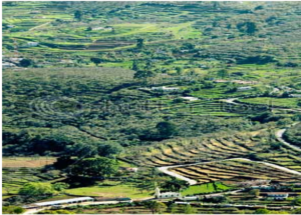
Fig.15.3.9: Terraced fields in Western Ghats Mountains in Kodaikanal, Tamil Nadu

The Western Ghats region in Tamil Nadu ranges from Gudalur Taluk in the Nilgiris district and ends up at Agastheeswaran Taluk in Kanniyakumari district. Since the Nilgiris district is covered under Hill Area Development Programme, it is excluded for the implementation of WGDP. Western Ghats region, therefore, falls in 33 taluks of eight districts, - Coimbatore, Tirupur, Dindigul, Theni, Madurai, Virudhunagar, Tirunelveli and Kanniyakumari. The total area covered under WGDP is 26,000 sq.km. which is 20 percent of the total area of Tamil Nadu.