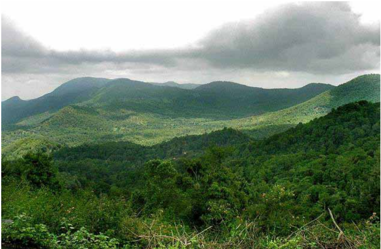
Fig.15.3.10: Western Ghats, Tamil Nadu

With a view to achieve the above objectives and to undertake the above activities, the outlay for implementation of WGDP during the Twelfth Five-Year Plan period is proposed at ₹113.85 crore with annual projection of ₹22.77 crore per year.