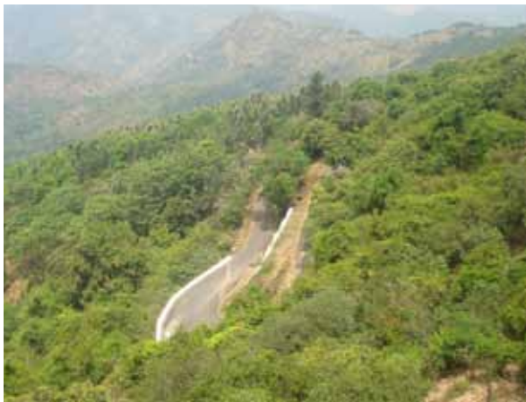
Fig.15.3.12: Eastern Ghats– Tamil Nadu

During the Tenth Five Year Plan period, an amount of ₹1.00 crore was sanctioned during 2005-06 for the implementation of Eastern Ghats Development Programme. Against this, an amount of ₹0.96 crore was spent on various activities by different departments.