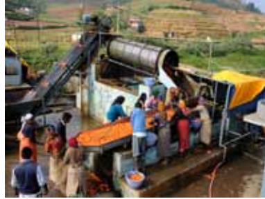
Fig.15.3.6: Post Harvest handling Unit at M-Palada