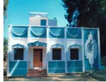
Fig.15.3.7: Construction of farmers training centre in Ooty