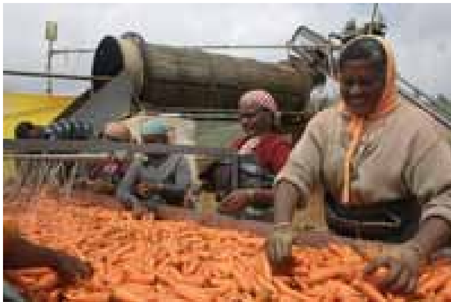
Fig. 15.3.4: Agriculture Development in HADP

mushroom production, floriculture, and research & development are undertaken. Other developmental activities such as provision of drinking water, construction of group houses, primary health centres, construction of Anganwadis, improvement of roads, approach paths/roads, construction of school buildings, drying yards etc are also taken during the Plan period. Strenuous attempts are made to include NGOs, local farmers associations, local user groups and local people in the implementation of the different schemes under HADP.