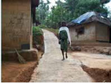
Fig.15.3.5: Basic Amenities to ST hamlets