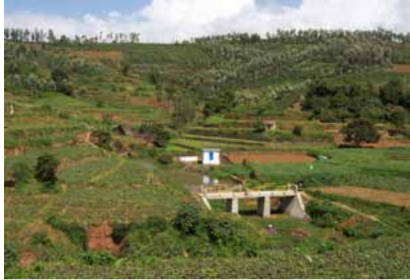
Fig.15.3.2: Provision of foot bridge in rural Ooty