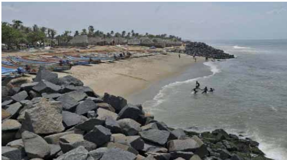
Fig.15.3.13: Coastal area - Tamil Nadu

The coastal area in Tamil Nadu is susceptible to cyclones periodically, which cause damage to life and property. The coastal area supports several important economic activities such as fisheries, ports, industries and tourism. Most ecologically critical and threatened areas in the coastal areas are coastal wet lands especially lagoons and estuaries and their mangrove swamps. The coastal areas provide food and shelter for waterfowls, fishes, crustaceans, molluscs including some of the world's lucrative